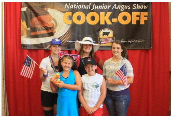
Intermediate Roast Cook-off Team.