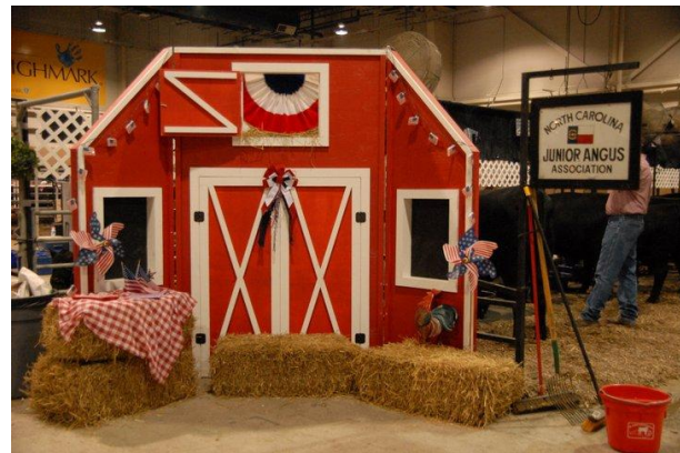
North Carolina stall display.