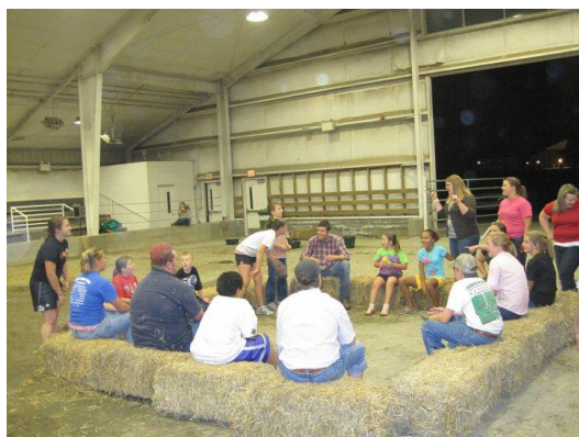
^ Ag Olympic fun